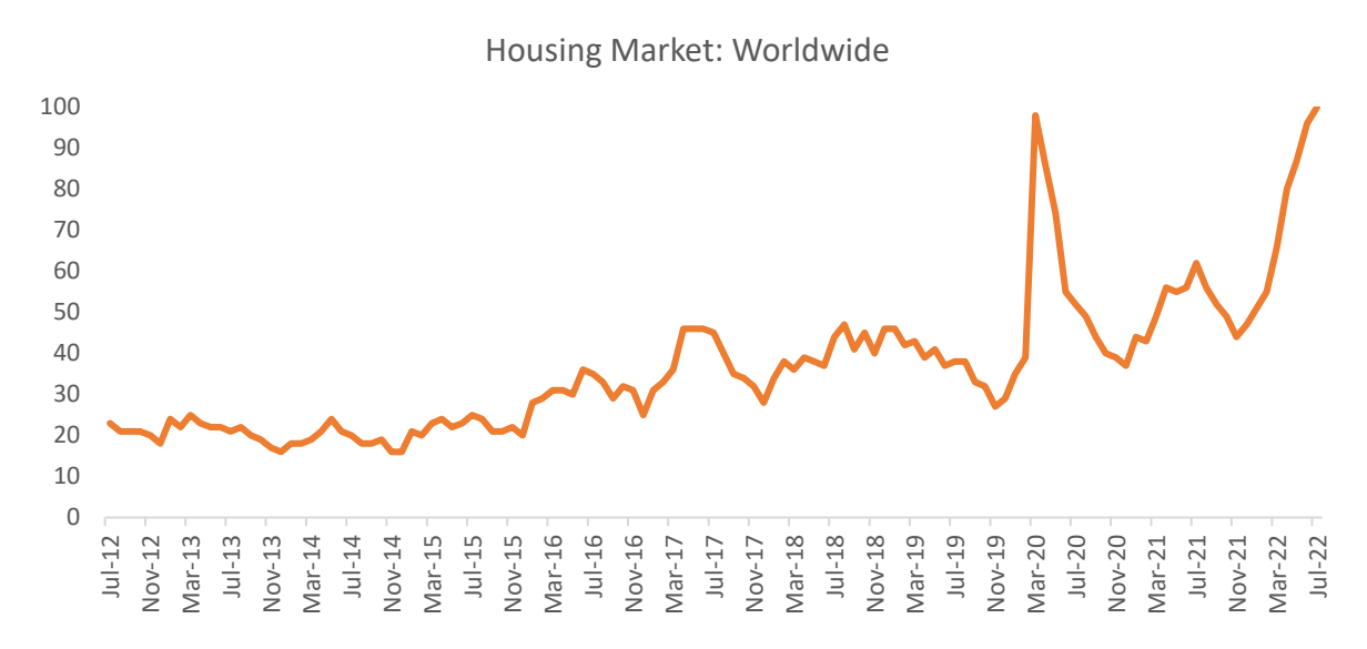
Chart 1: Google Trends – Housing Market search term popularity

Source: Google trends. From 31/07/2012 – 31/07/2022. As at 02/08/22.